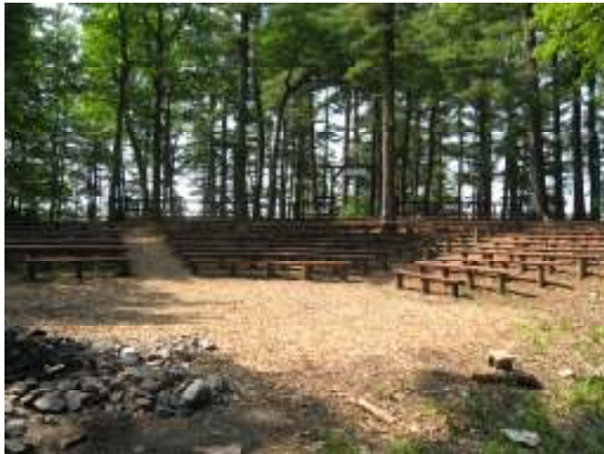
Camp Hinds Council Ring with the turtle fire ring.

In 1999, Abnaki Chapter installed seating at the Camp Gustin council ring, where there was none before.