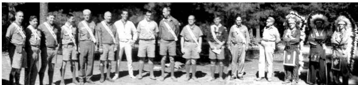
Vigil Honor Members after the 1966 induction ceremony.