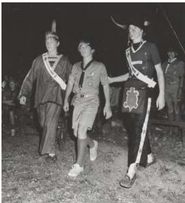
A candidate is escorted during a tapout ceremony, 1951

With the assistance of members from the early years of our lodge, the original ceremony site was located in 2004. In celebration of the lodge’s 60 th anniversary, a replica altar fire ring was constructed, and a marker was installed.