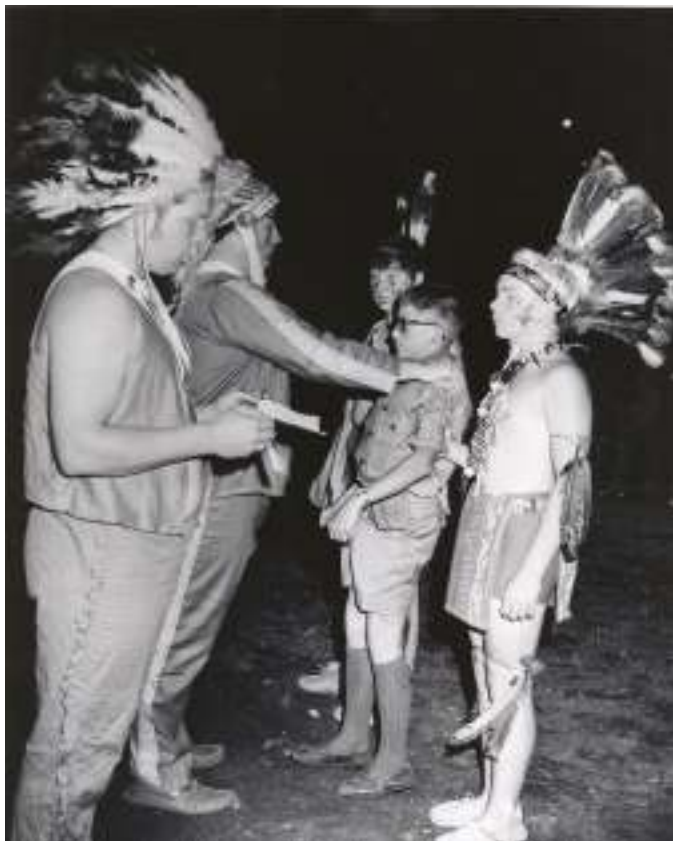
Tapout ceremony, 1970

In the first several years at Camp Hinds, many members contributed their talents in decorating the ceremonial grounds and council ring, making shields, totems, torches, and other devices, most of which have been lost, worn out, or replaced in the intervening years. The large two-piece thunderbird still seen at Camp Hinds as recently as a couple years ago was made around 1952 by