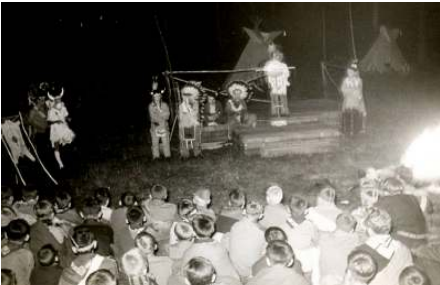
Tapout at the Camp Hinds Council Ring, 1951

were held, then assigned spots along the trail for the night. Each candidate was required to carve a small wooden arrow which he wore suspended around his neck all through his Ordeal. Any spoken word had to be marked by a notch carved in the arrow, and "explained" in the interview at the end of the day.