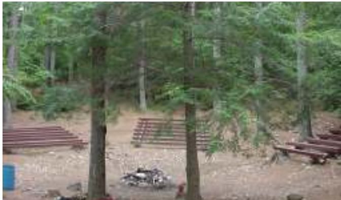
Camp Bomazeen Council Ring with new seating.