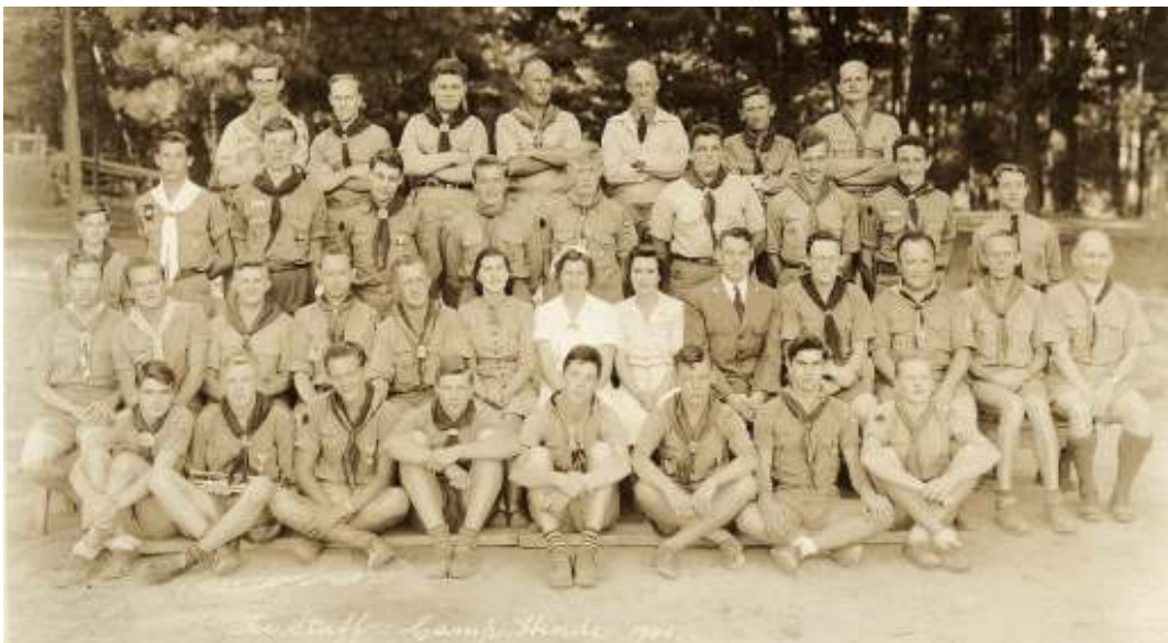
Camp Hinds Staff, 1944

Since all the candidates had already been elected before going to summer camp, most of them began coming to the June Ordeal weekends instead of waiting until their troop went to camp. The need for summertime ceremonies were gradually eliminated. There have been several attempts in recent years to hold midsummer Ordeals, but the difficulty in fitting that program into an already crowded camp schedule has proven hard to overcome.