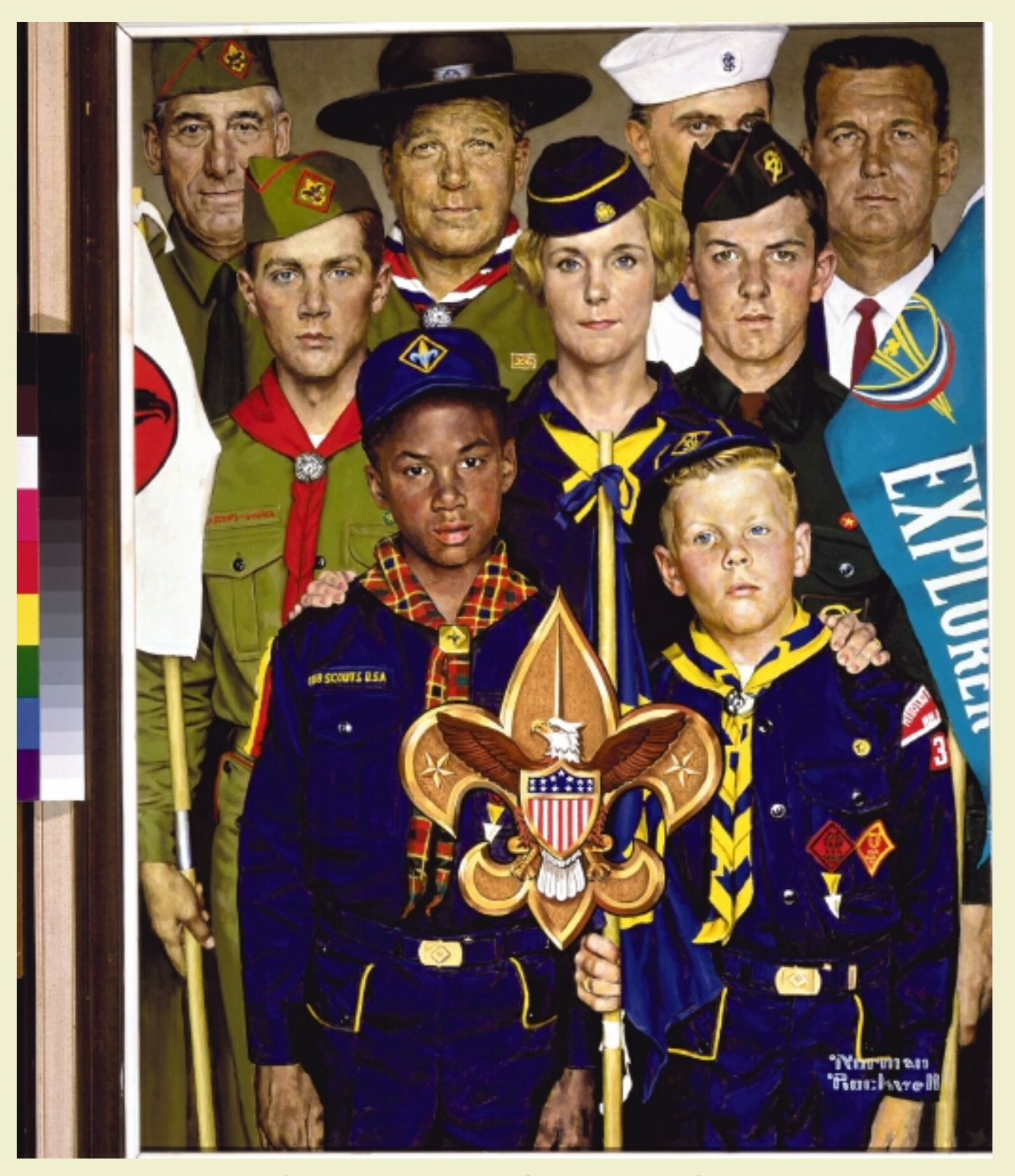
Pine Tree Council, BSA www.pinetreebsa.org