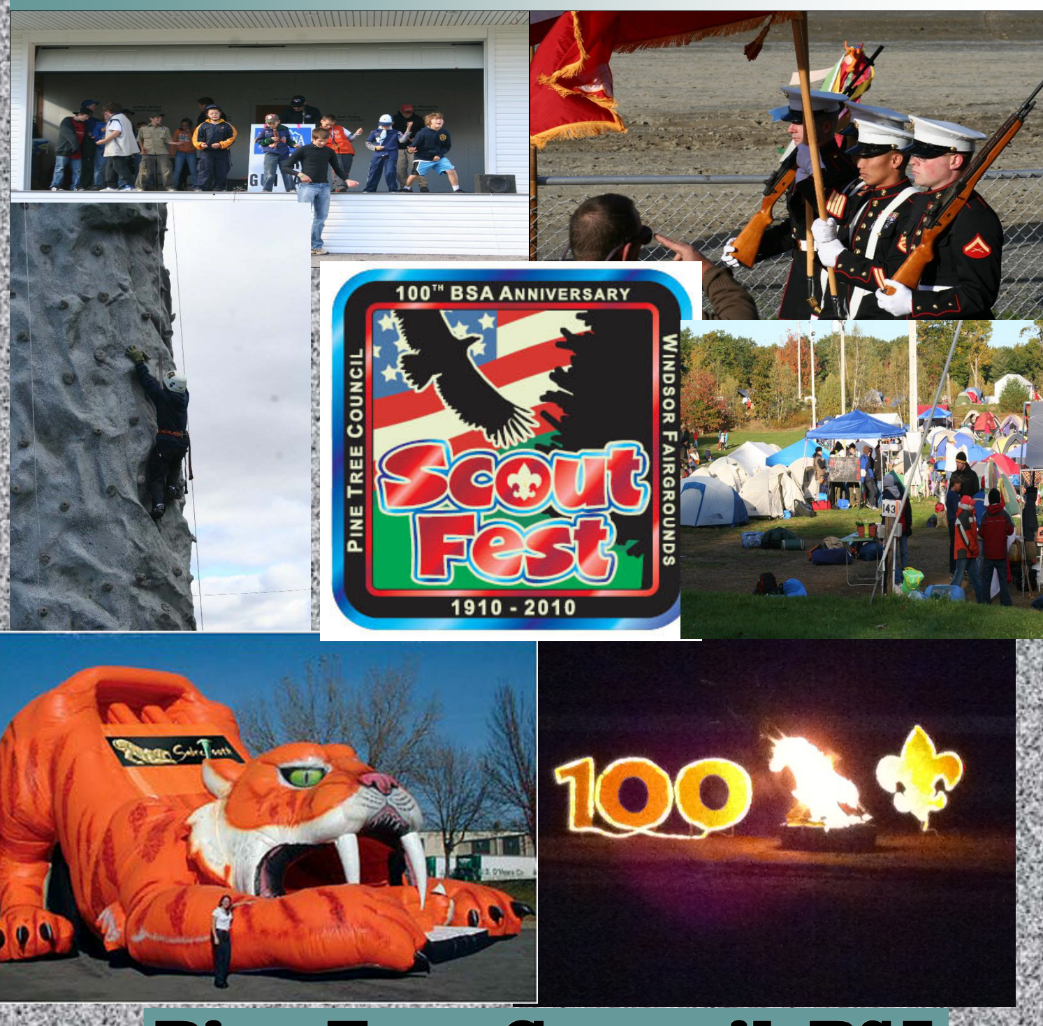
Pine Tree Council, BSA

Celebrating ScoutFest 100th Anniversary of the Boy Scouts of America