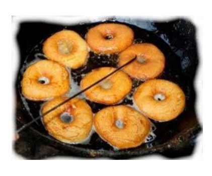
Donuts and Snacks

Bring your dutch oven on your next campout and have fun cooking some great tasting snacks. Learn to cook and eat donuts and other snacks such as monkey bread, funnel cake, cobblers, dump cakes, pine apple upside down cake, fried dough, and apple pie bites. Scout will help cook some of these treats and will get to sample the goodies.